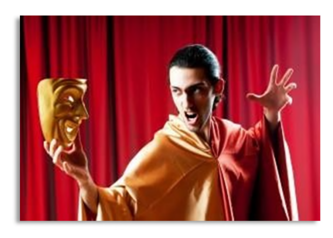
4. Do you like to act? actor