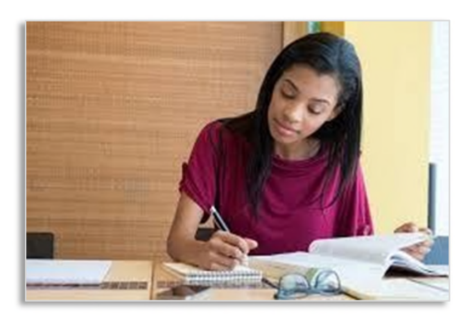
4. What is she doing? study History