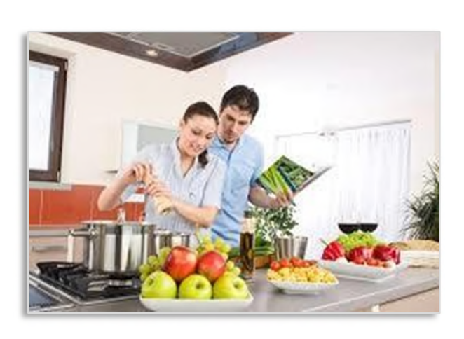
6. Are you and your husband busy? cooking / dinner