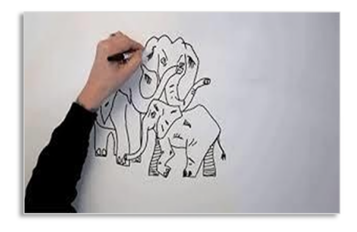
7. Is Peter busy? drawing / animals