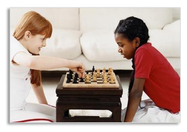
3. What are the children doing? play chess