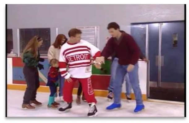
1. Do you and your friend like to skate? skater

B : No, I don't. I'm not a good swimmer.