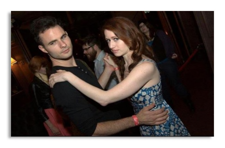
5. Do you and your boyfriend like to dance? dancer