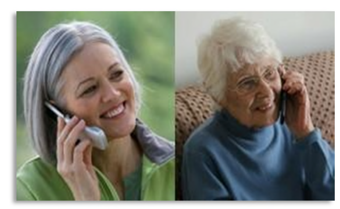
2. What are you doing? call my mother