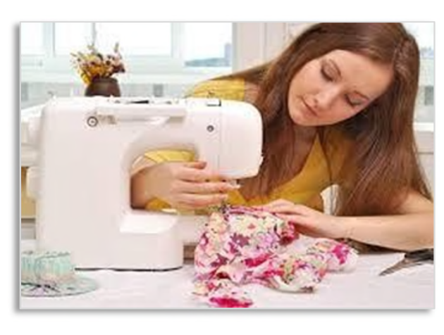
4. Are you busy? sewing / blouse