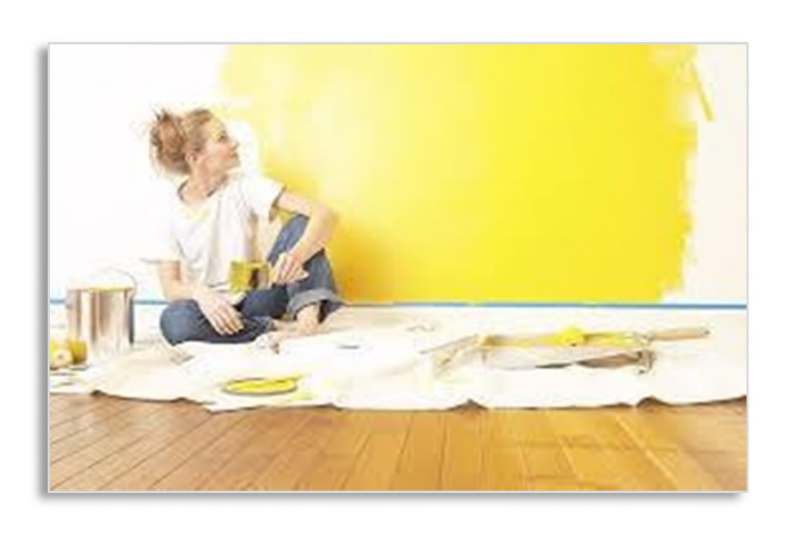
5. Are you busy? painting / room